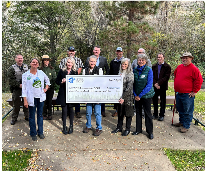
SPI representatives presenting the donation to Whiskeytown Environmental School in November 2023 pictured alongside the Shasta County Office of Education, WES Community, and Whiskeytown National Recreation Area/National Park Service